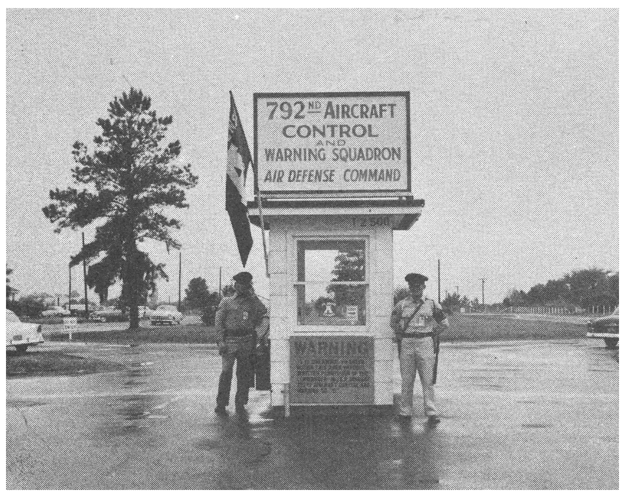
Main gate to the 792 area.